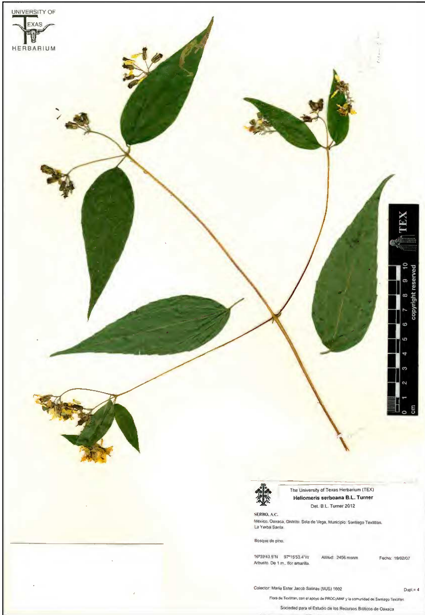
Fig. 1. Heliomeris serboana (Isotype: TEX).